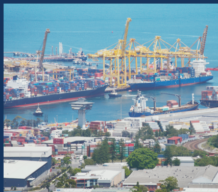
Transport and Marine