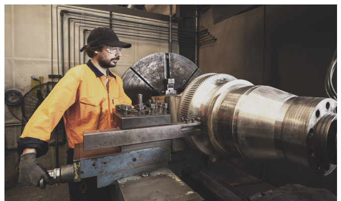
Machining: Cylindrical Grinding, Horizontal Boring, Haas 5-axis CNC Milling, Cylindrical Grinding, and Lathes