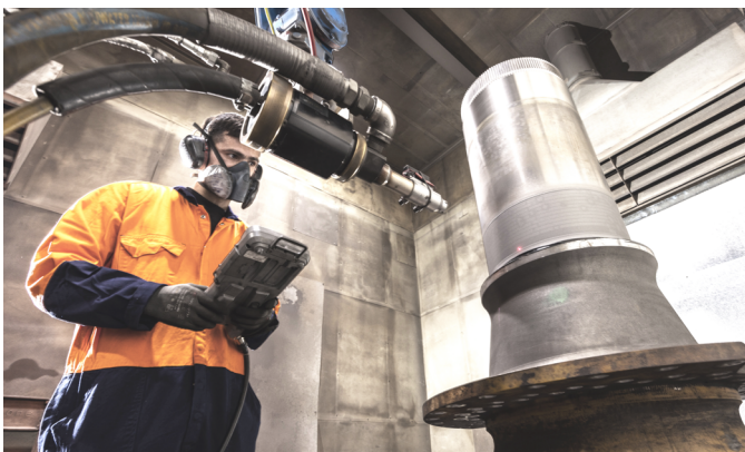
Metallising: High-Velocity and Thermal Sprayed Coatings

From the very latest robotic controls and precision lasers to more traditional surface engineering and repair processes, we offer a complete range of solutions and a comprehensive array of technologies.