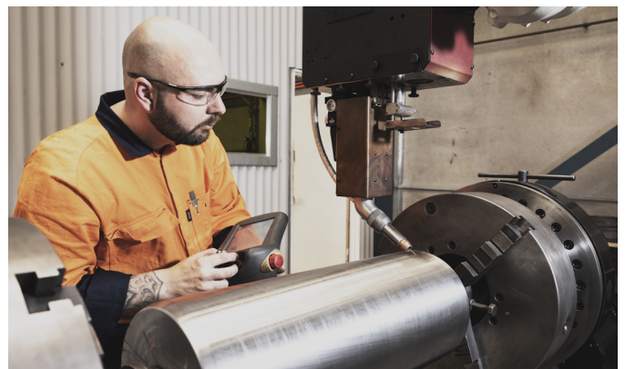
Precision Power Laser Cladding