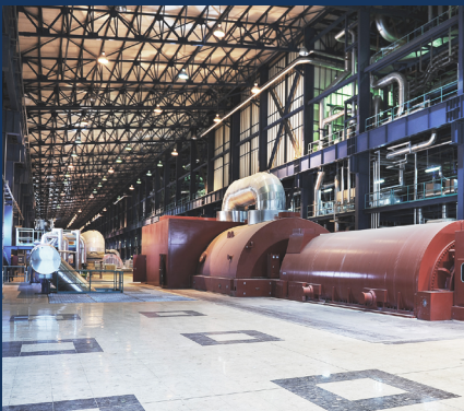
Industrial Gas and Air Turbines