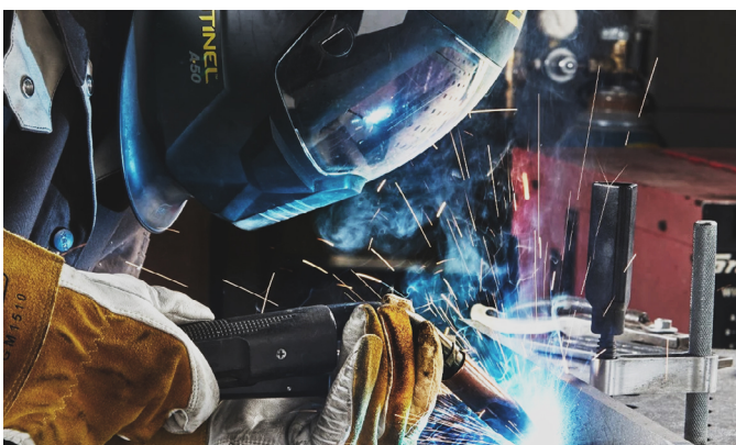
Welding: MIG, TIG, Arc, Cast Iron