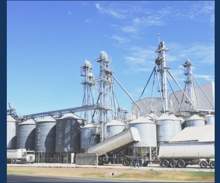
Food and Beverage Processing